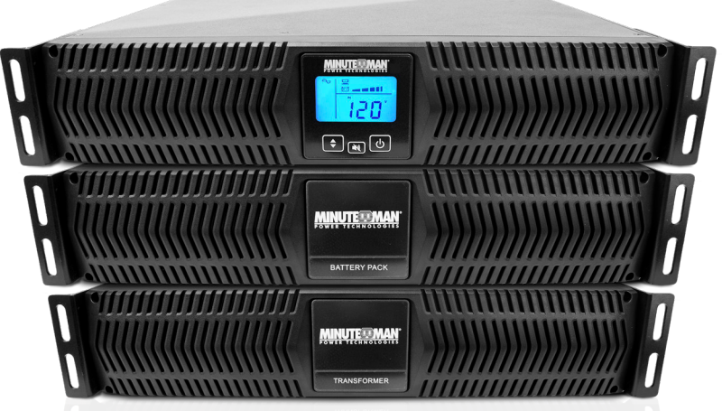
Endeavor 5/6kVA 2U control unit, battery pack, and transformer (6U total height) <sup>1</sup>U.S. 48 & Canada only