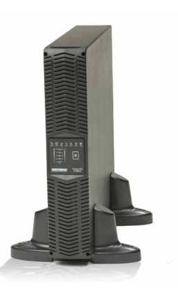
EnterprisePlus™ UPS Model E750RM2U with tower mount stand provided (standard)