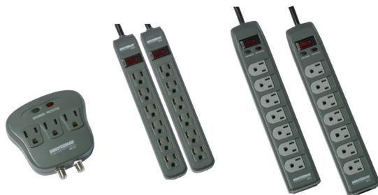
MMS110 & MMS130C MMS362P 'Twin Pack' MMS370 & MMS370T