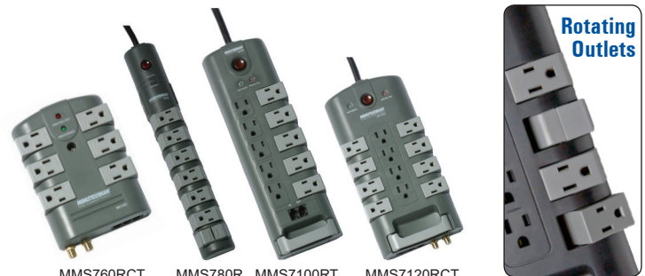
MMS760RCT MMS780R MMS7100RT MMS7120RCT