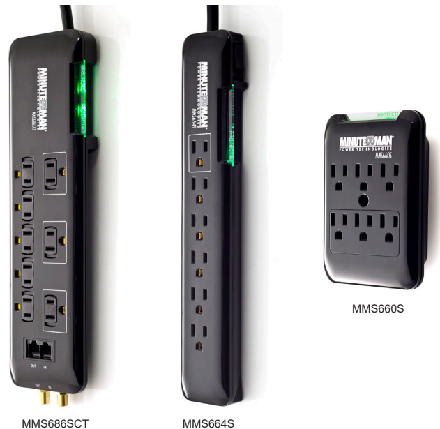
MMS686SCT MMS664S MMS660S