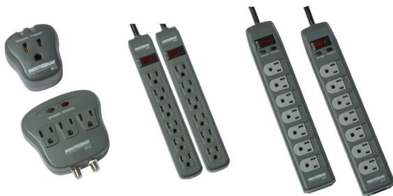
MMS110 & MMS130C MMS362P 'Twin Pack' MMS370 & MMS370T