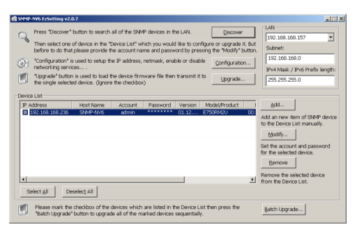
EZSetting configuration screen (NV6)